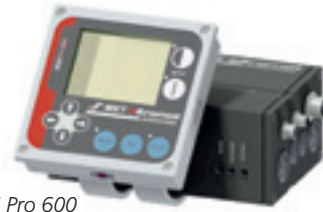
CLS Pro 600