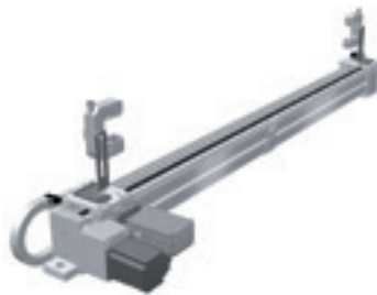
Sensor positioning device FVGPro MK