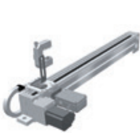
Sensor positioning device FVGPro