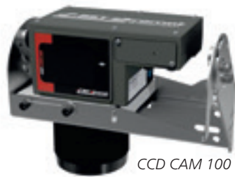
CCD CAM 100