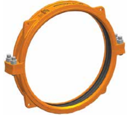
AGS couplings in 26 to 60 inch (660 to 1500 mm) sizes feature a two-piece housing and four bolts and nuts.

Because the AGS coupling system provides great strength and dependability in addition to speed, it's an excellent choice over welding. Other advantages AGS joints provide over welded joints include no flame, superior seismic-shock resistance and a union at every joint for easy adjustment, system maintenance or system expansion.