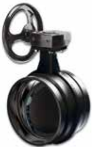
Butterfly and Check Valves are available for a variety of services. Size may vary. Contact Victaulic for details.