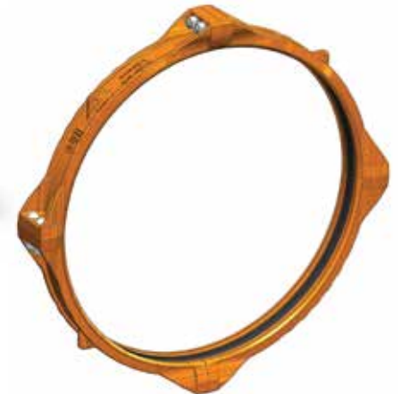
AGS couplings in 62 and 72 inch (1550 and 1800 mm) sizes feature a four-piece housing and eight bolts and nuts.