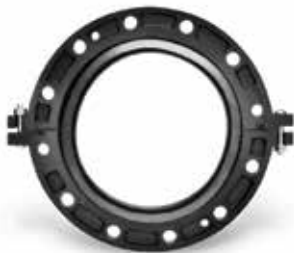
AGS Vic-Flange® adapters are ANSI CL. 125/150 Flanges.