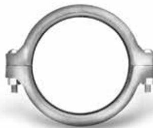
Rigid couplings for stainless steel rated to 300 psi/2065 kPa.