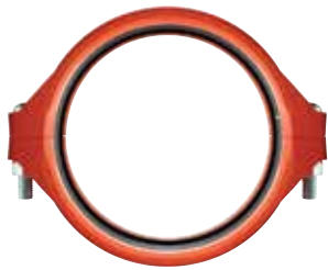
Available as rigid and flexible, couplings.