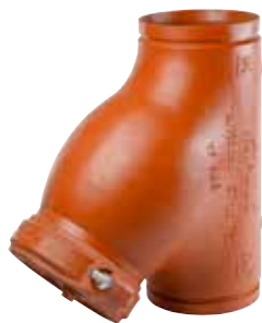
Strainers and Suction Diffusers are available for protecting pumps.