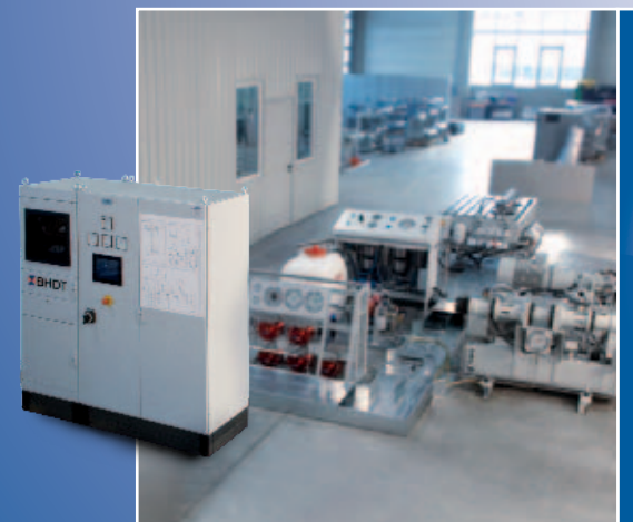
HIGH PRESSURE VALVE TEST STATION PN 550 MPa