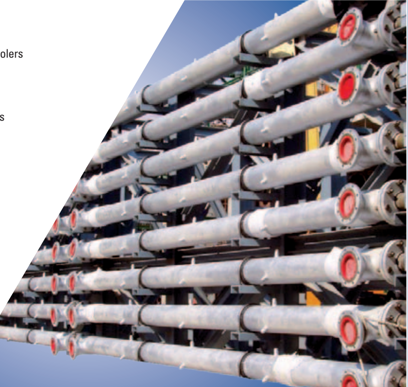
HYPER COMPRESSOR INTERSTAGE COOLER (under construction) PN 160 MPa