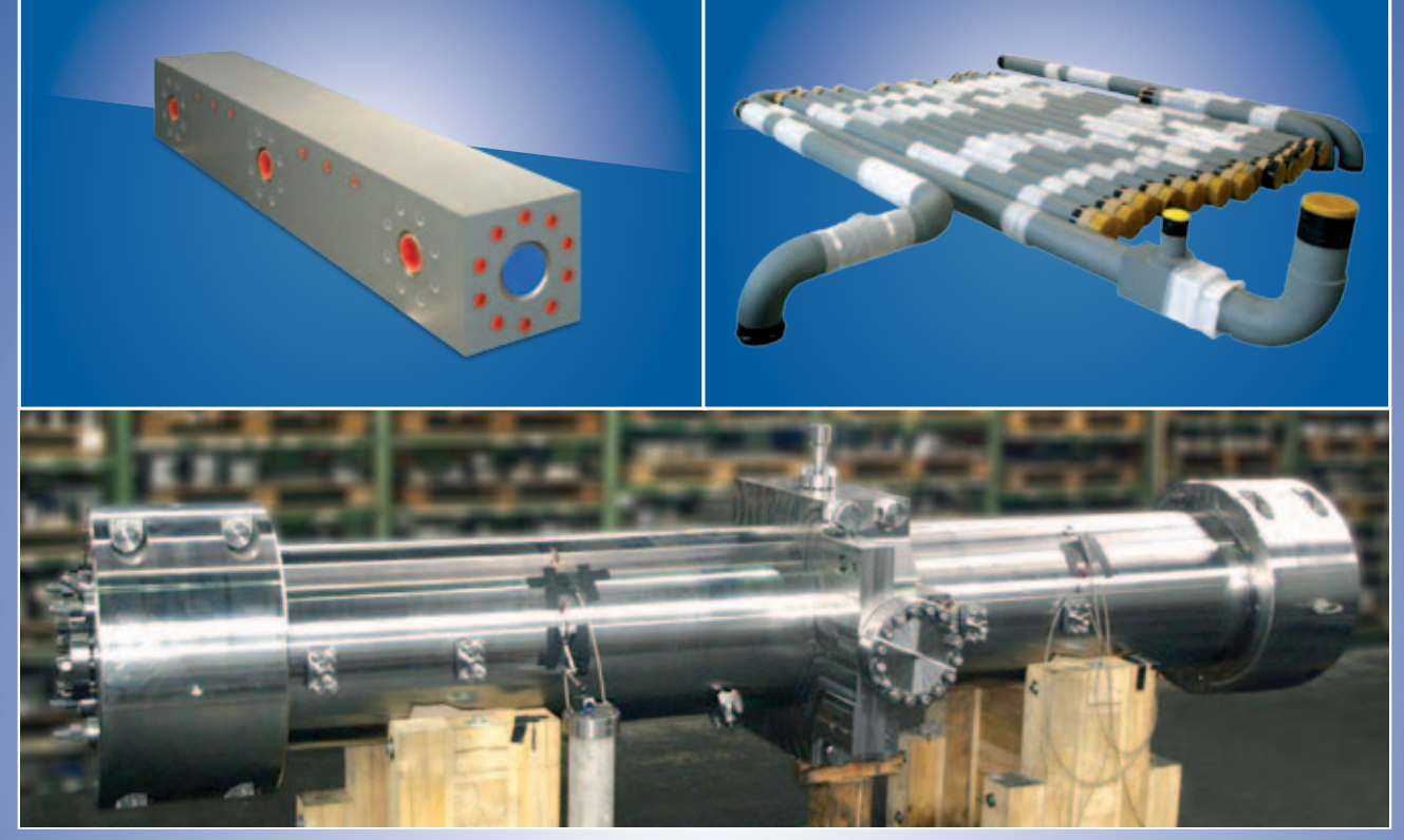
AUTOCLAVE REACTOR PN 245 MPa