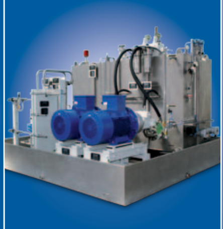
HYDRAULIC OIL UNIT For the hydraulic oil supply in LDPE applications

HIGH PRESSURE RELIEF VALVE Hydraulic operated fast-acting high pressure relief valve with manual blocking device PN 320 MPa