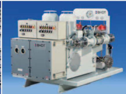
PEROXIDE DOSING PUMP PN 350 MPa Flow rate 18 – 150 l/h