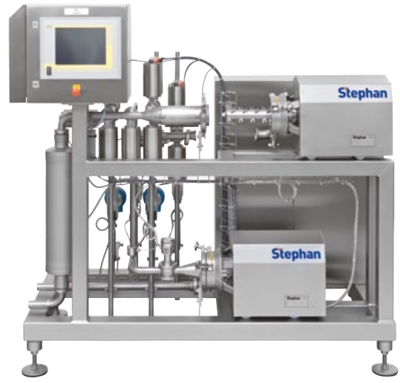
STEPHAN EMULSIFYING MODULE