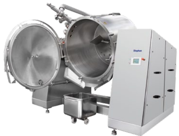
STEPHAN COOKING MIXER