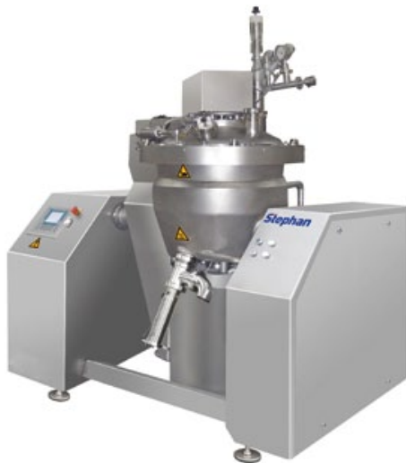
STEPHAN Universal Machines