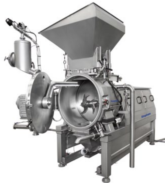
STEPHAN TC COMBICUT