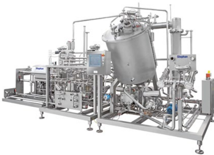
STEPHAN UHT SYSTEM