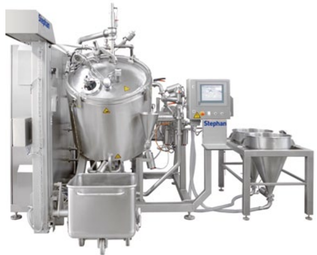
STEPHAN VACUTHERM® SYSTEM