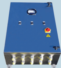
ELECTRONIC CONTROL DEVICE ECU-1000