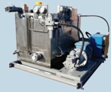
HYDRAULIC POWER UNIT

It is an electronic device that provides operational, safety and diagnostic functions through a single or double acting actuator mounted on a valve driven by an external single or redundant solenoid valve. It enables diagnostic functions, including partial stroke test and continuous monitoring of valve actuator pressure and position, to be carried out with the valve on-line and in service with no disruption to the process.