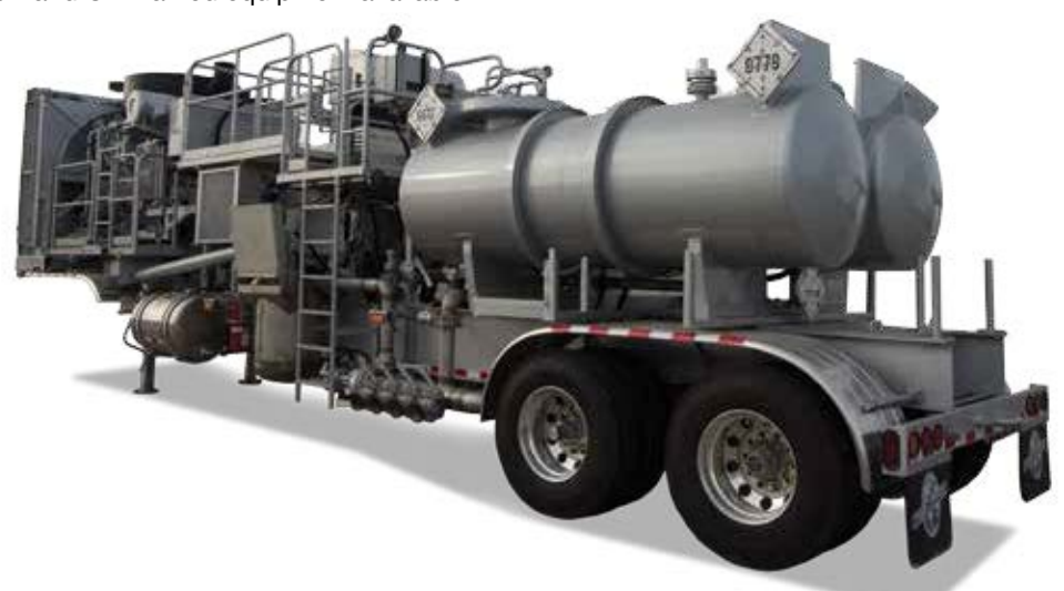
AT-1001 Trailer Mounted Acidizing Unit