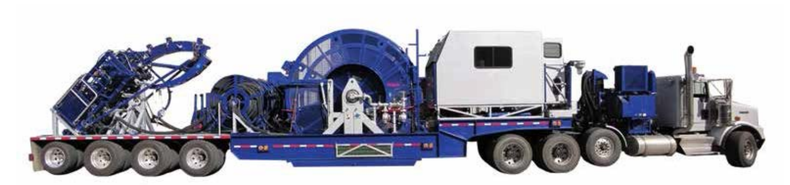
TT-100-XC Coiled Tubing Unit