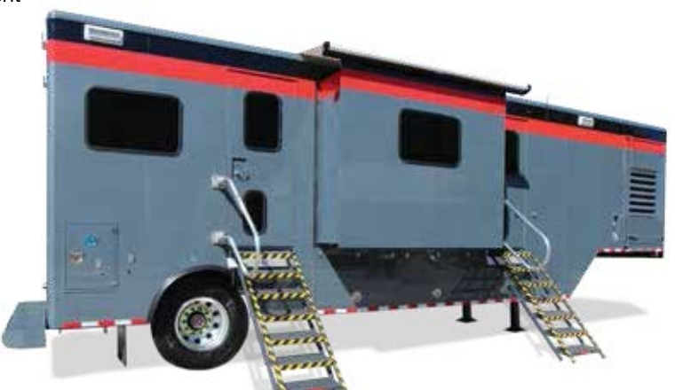
ET-33EXP Trailer Mounted Data Acquisition and Control Center