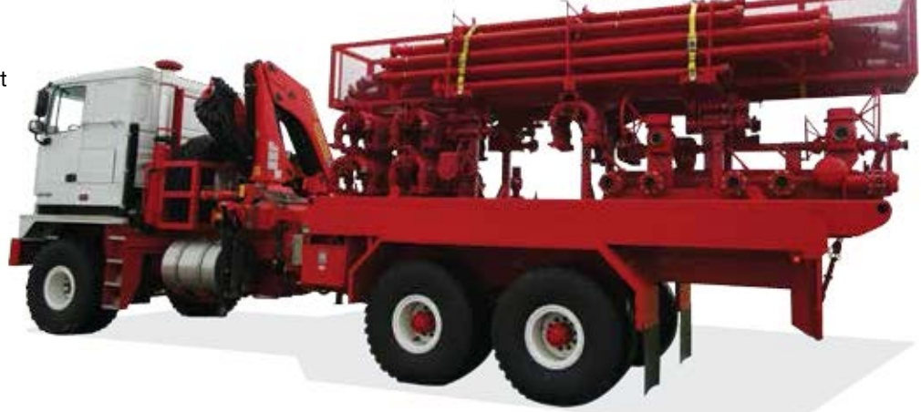
Truck Mounted Manifold and Iron Transport