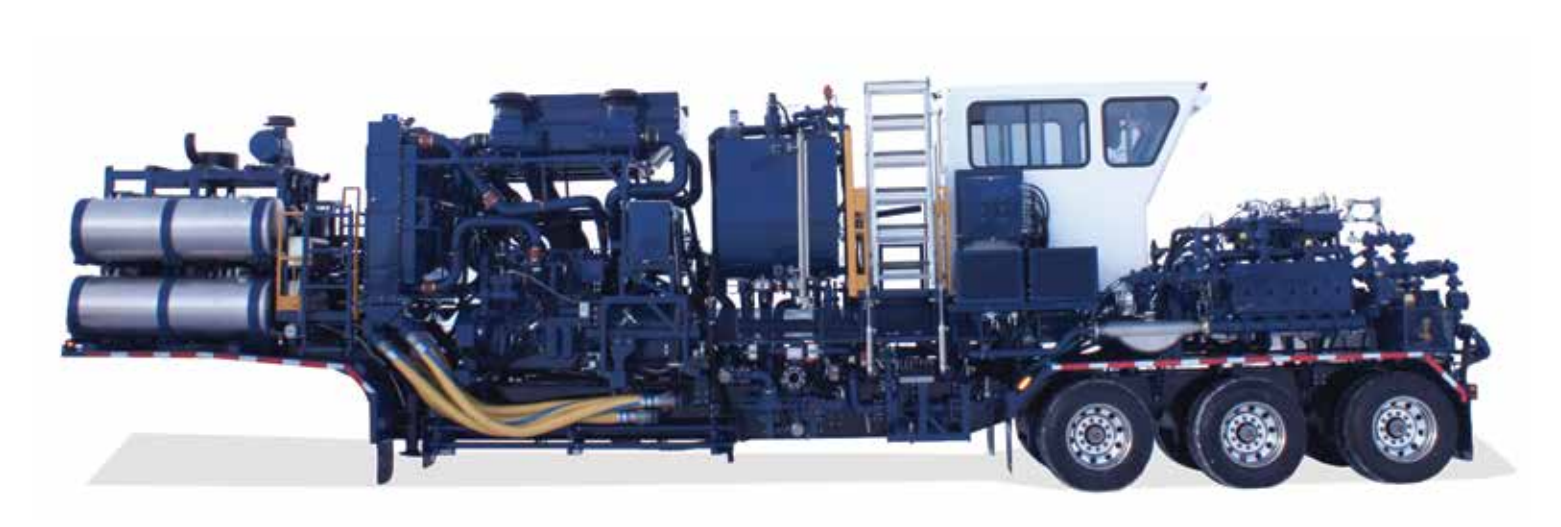
PRW-2000 Twin High Rate Pumper