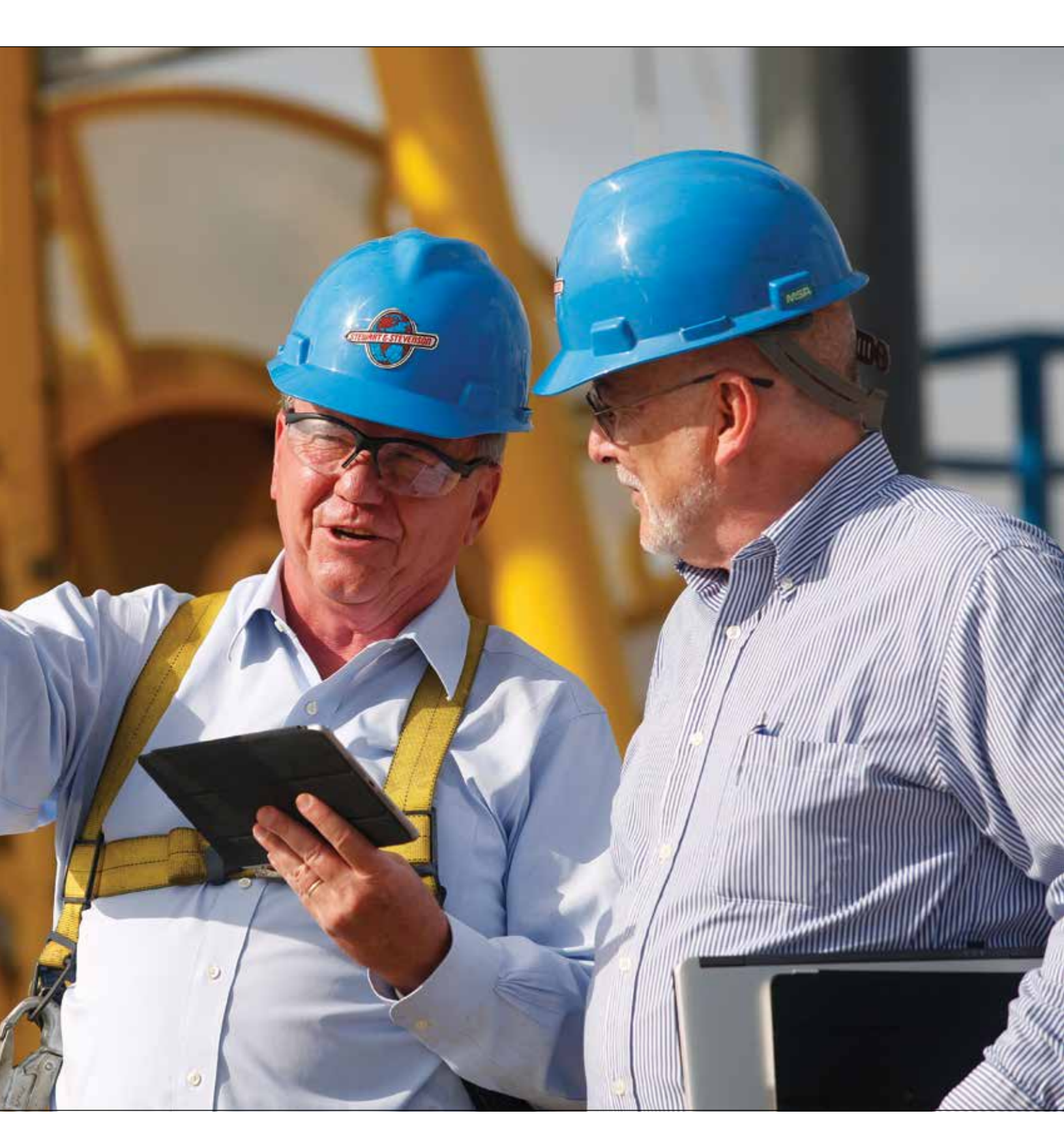
16-02-17 ©2016 Stewart & Stevenson The information in this publication, including text, images and links, which may change at any time, is provided "AS IS" by Stewart & Stevenson without warranty of any kind, either expressed or implied, including but not limited to, the implied warranties or merchantability, fitness for a particular purpose or non-infringement. Stewart & Stevenson is a registered trademark of Stewart & Stevenson LLC.