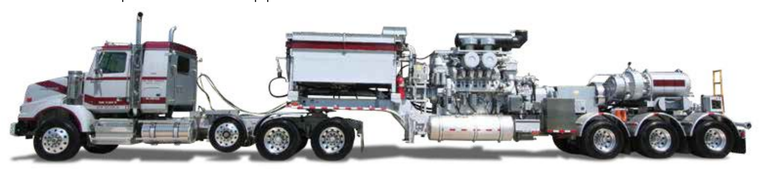
FT-2251 Trailer Mounted Fracturing Unit