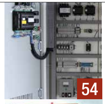
DRIVE SYSTEMS & SWITCHGEAR