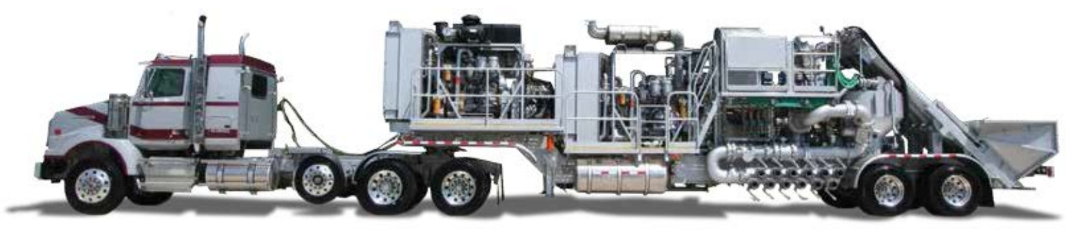
MT-132 Trailer Mounted Fracturing Blender