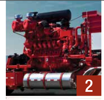
WELL STIMULATION & FRACTURING