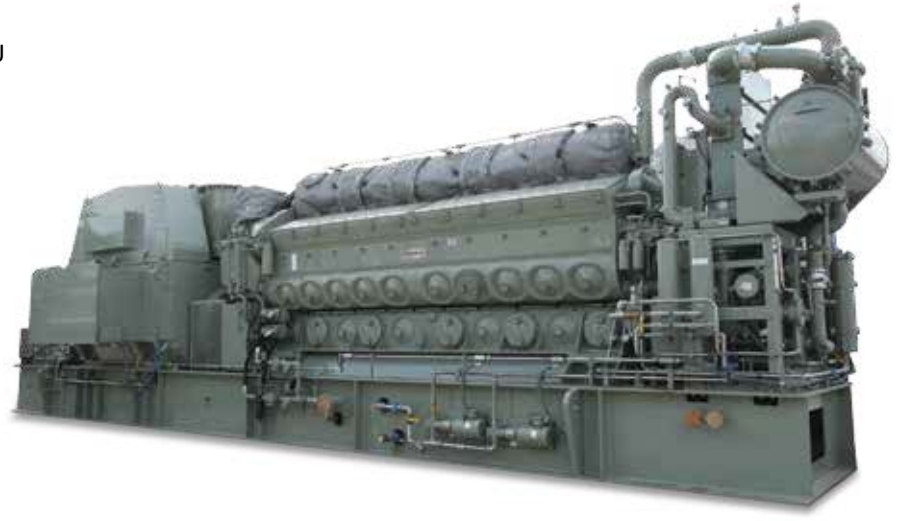
EMD 20-710 Offshore Generator