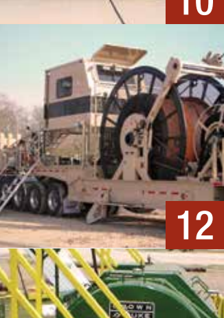
WELL INTERVENTION & COILED TUBING